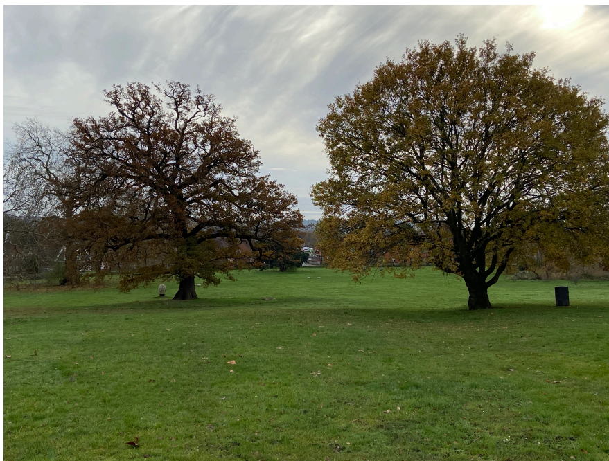
(Oaks on Bellfields Green, Guildford)

It's interesting what you see when you really take time to look: In late November, I had noticed some flowers/weeds that looked like violets nestled under an evergreen bush full of red berries. That same week, someone had also drawn my attention to all the buds already appearing